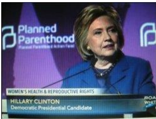
Hillary Clinton addressing PP

Chelsea Clinton may have topped all the expected hyperbole surrounding the possible overturning of Roe v Wade by the Brett Kavanaugh nomination, when she asserted Roe was good for the country. Legalizing the aborting of their children freed millions of women to get back into the work place, she said, and this poured 3 and ½ trillion dollars into the economy since it was handed down in 1973. The "free press" is according her commentary ample circulation. How absolutely callous of her to forget the over 60 million beating human hearts which have been intentionally stopped by Roe v Wade – legally.