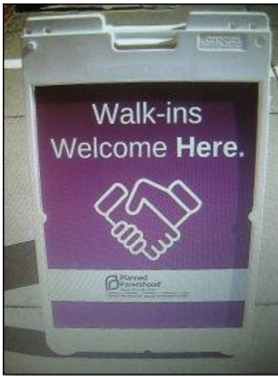
Walk-in sign outside PP