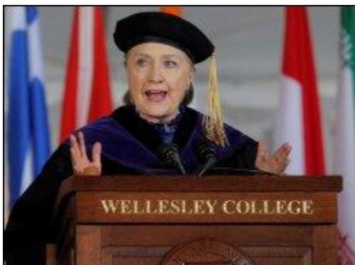
Hillary Clinton speech at Wellesley College

In other swing votes by Kennedy this past June, the court curtailed unions from forcing employees into membership. This legal thinking aligned itself with the efforts of Project REFORM decades earlier here in Massachusetts, which won a membership vote in the 1970s to prevent teachers from being forced to join the National Teachers Association (NEA). The NEA used its dues money and political power to force another vote, which it won. Now once again, this time by a Supreme Court ruling, the NEA can no longer impose forced national membership. The ruling is a monumental gain for teachers who resent being required to join the country's largest labor union with its all-out support of Leftist causes and Democrat politicians.